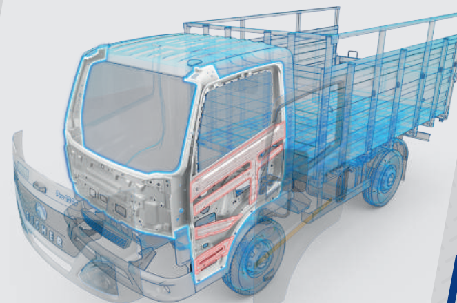
Dual panel cabin adapted from Japanese design