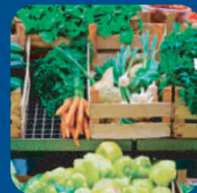
Fruits & Vegetables