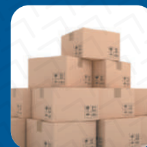
Parcel & Courier